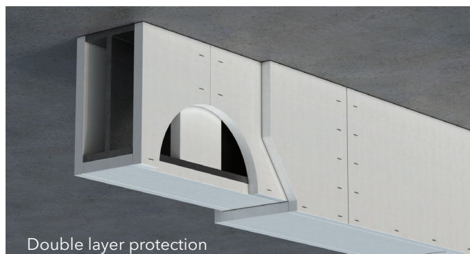
Double layer protection