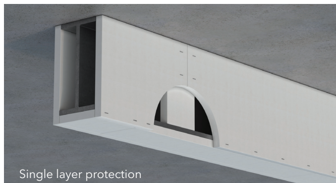
Single layer protection