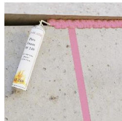
Fill the horizontal expansion joint tightly with Piro Foam PF 240