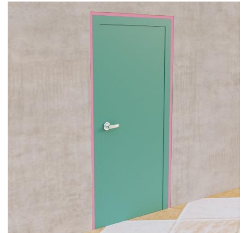
View of a properly sealed gap between the door frame and the wall