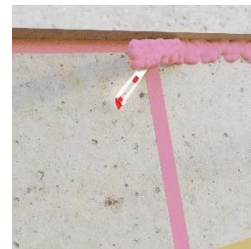
Use a knife to trim off any excess Piro Foam PF 240