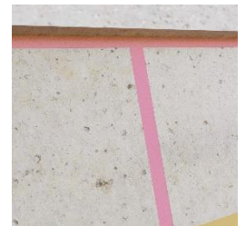
View of a properly sealed horizontal and vertical expansion joint in the wall

More information on applications and instructions can be found at: