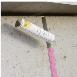
Fill the vertical expansion joint tightly with Piro Foam PF 240