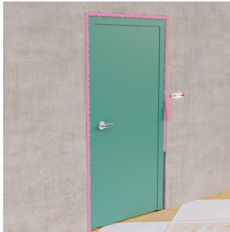
Use a knife to trim off any excess Piro Foam PF 240