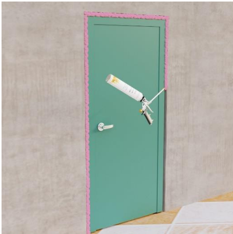
Fill the space between the frame and the wall with Piro Foam PF 240