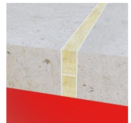
Properly protected expansion joint