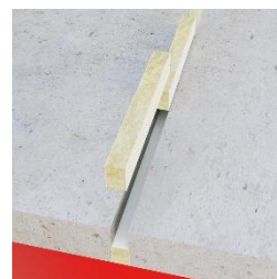
Fill the remaining expansion joint with mineral wool boards with a density of 80 kg/m 3 with Piro Acrylic Sealant AC120 applied previously, the same way as in step 1