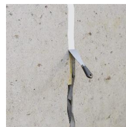
Apply Piro Acrylic Sealant AC120 so that a layer is formed. Use a putty knife to level it