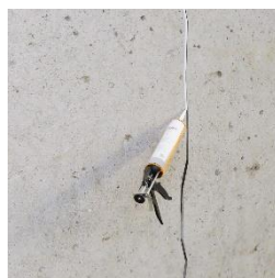
In case of narrow gaps not filled with wool, insert Piro Acrylic Sealant AC120 as deep as possible into the gap