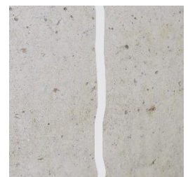
Properly protected wall gap

More information on applications and instructions can be found at: