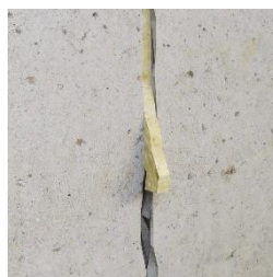
In case of deep gaps fill them partially with mineral wool