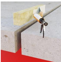
Apply Piro Acrylic Sealant AC120 on both sides with a 3 mm thickness on the mineral wool board with a min. density of 80 kg/m 3