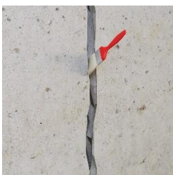
Prepare the gap by brushing off loose parts and dust with a brush