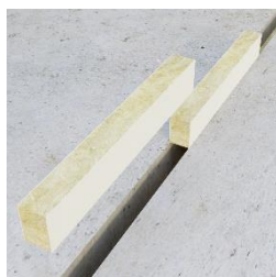
Place prepared mineral wool boards inside the expansion joint at one of its edges